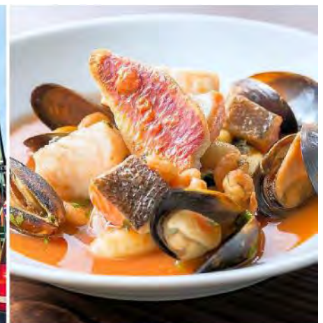
The Crown Manor House Hotel, Lyndhurst