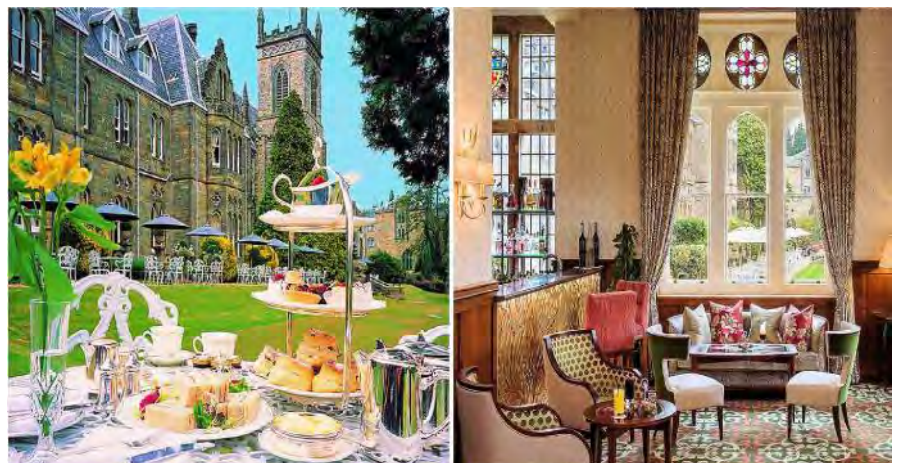
Ashdown Park Hotel, Sussex

En route to the Ashdown, we visit The Weald and Down Museum – where 1000 years of Sussex rural history is on display in over 50 historic