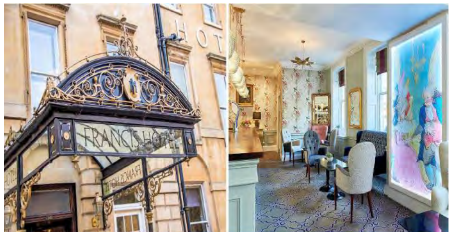
The Francis Hotel, Bath

Do you fancy a lazy morning off? Well, here it is: your chance to relax or go exploring in this flower-filled town on