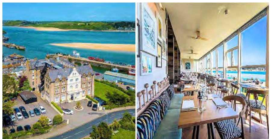
The Harbour Hotel, Padstow

Padstow ’s too nice to go rushing through like exhausted tourists, so we’ve got the day off: to enjoy this unique seaside location to the full ... wander the waterfront with its colourful fishing boats and pleasure craft ... do some