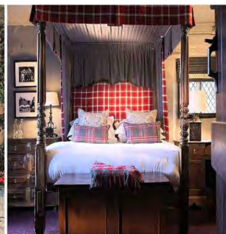
The Lygon Arms Hotel, Broadway