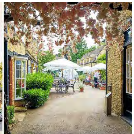
The Bear Hotel, Woodstock